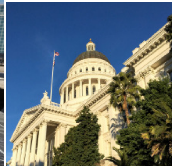
California State Capital