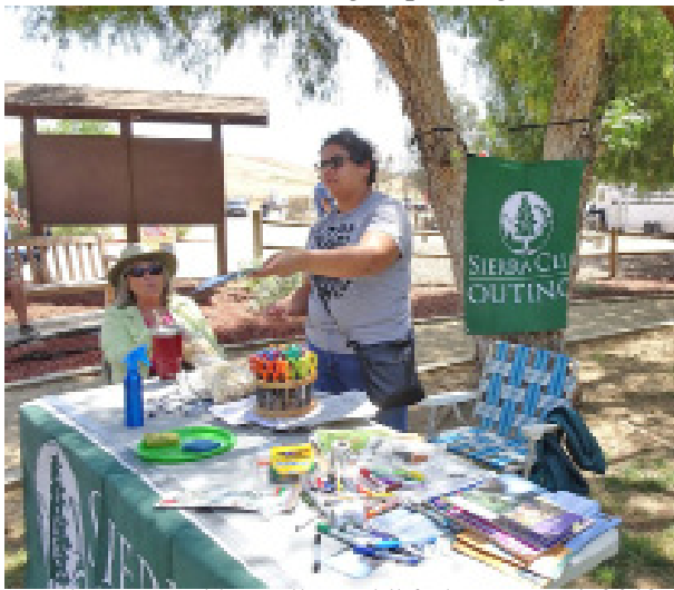
Duck Daze, Hidden Valley Wildlife Area, May 4, 2019.