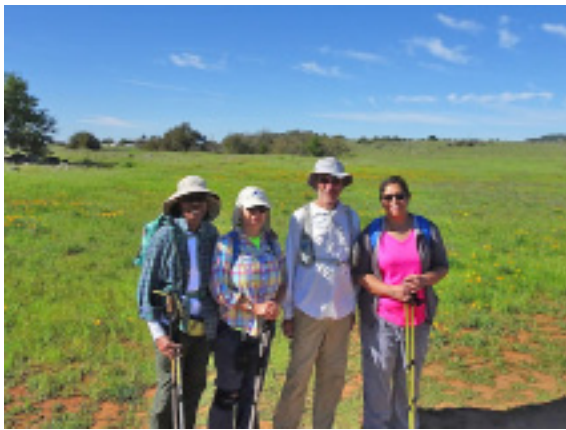
Santa Rosa Plateau hike, April 7, 2019.