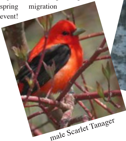
male Scarlet Tanager

Where San Bernardino County Museum, 2024 Orange Tree Lane, Redlands (California St. exit off 10 Fwy)