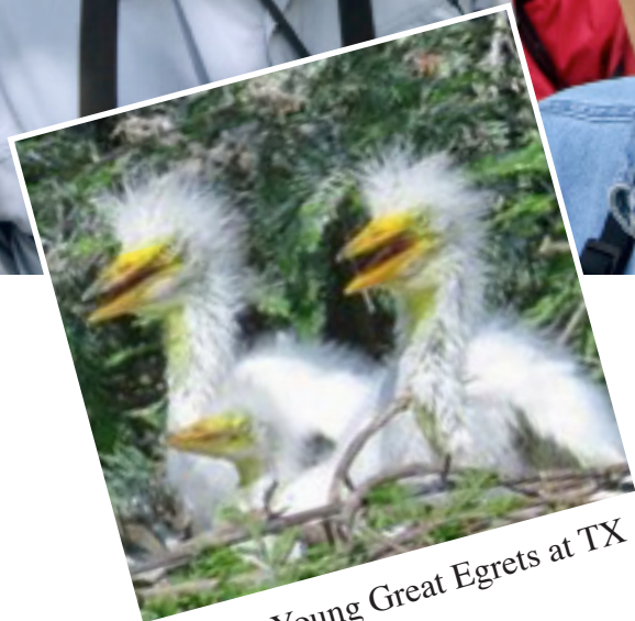
Young Great Egrets at TX